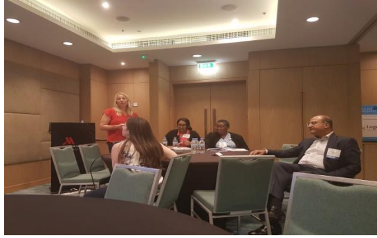
IAPHL officials are moderating panels and taking notes of presentations