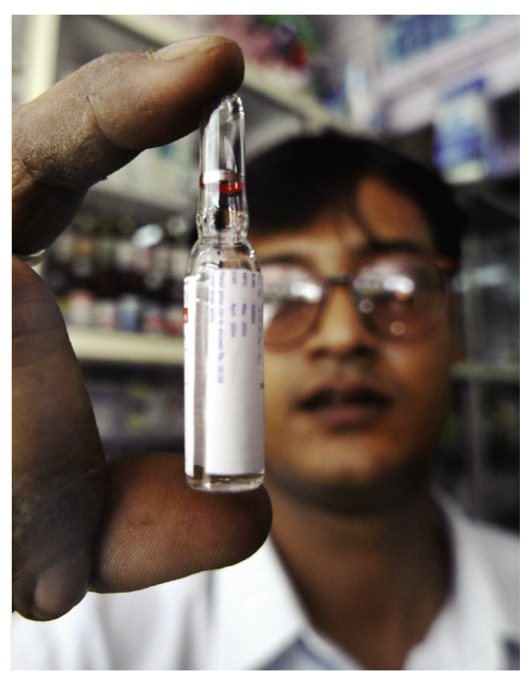
Vial consequences: Experts believe 1 in 5 drugs sold in India is a fake.

In January, Sati and I drove for more than an hour down rutted roads in the state of Uttar Pradesh to visit a "drug factory" where some of India's fake