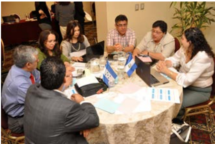
USAID | DELIVER PROJECT 2009

Country teams from Guatemala and Honduras work together to share lessons on procurement at a Latin America and the Caribbean Contraceptive Security Initiative regional workshop in Lima, Peru.